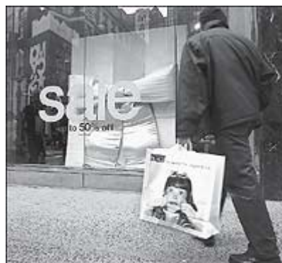
Some consumers don't make a spending plan for Christmas or other occasions and then are shocked when the credit-card bills arrive, debt counselors say.